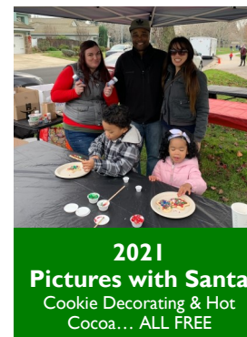
2021 Pictures with Santa Cookie Decorating & Hot Cocoa... ALL FREE