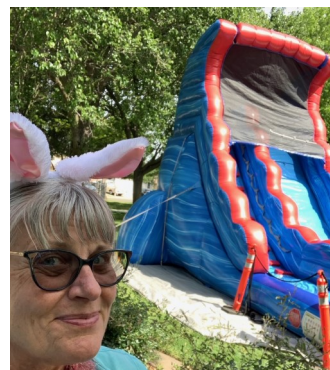
2022 Spring Carnival Giant Slide, Carnival Games & Prizes ... ALL FREE because of CNA memberships

Not only is our annual Music by the Lake event amazing, the other events sponsored by the CNA are also legendary with FREE attendance! If you are new to Camden or haven't attended our events, below are just a few pictures from the 2021-22 CNA year of events!