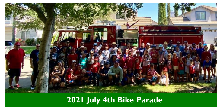
2021 July 4th Bike Parade

YOUR CNA MEMBERSHIP allows us to host these amazing family friendly events. We need at least 306 households, out of the 900+ households in Camden, to join this year (July 2022-June 2023) to fund the upcoming events. Its only $50 per household! As a CNA member you also receive perks like free raffle entries at events that have raffles (which is most events)!