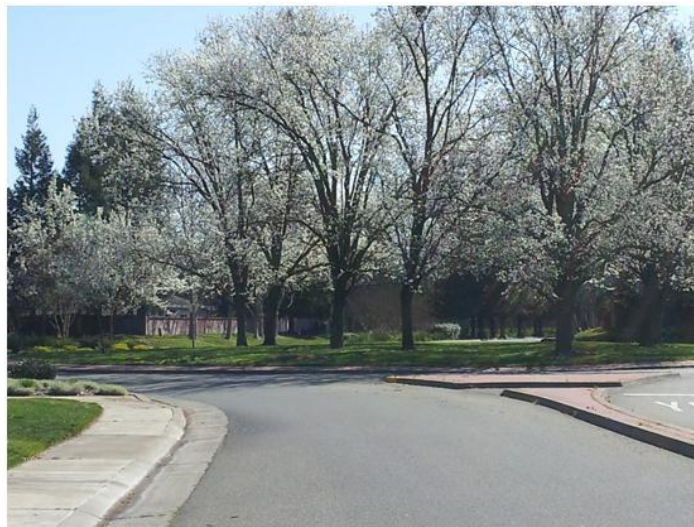
Beautiful Blooms at the Camden Roundabout—Springtime!