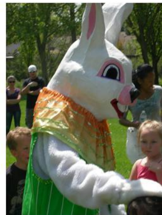
Easter Egg Hunt in Mix Park